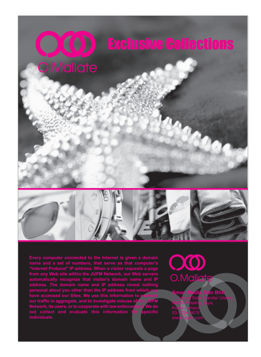
Filled with K(Black) and M(Magenta) to represent the actual artwork colour.